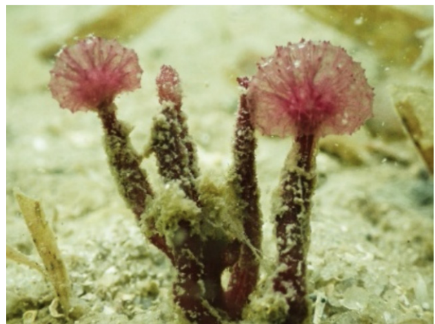
Fig. 4. Multiple O. sagittaria individuals observed in situ at the study site, illustrating their small size and solitary occurrence on the seabed

are minimal (Sivaleela and Raghunathan, 2024), our finding fills the gap in the biogeography of O. sagittaria . Due to limitations in the collection of specimens and the observation being opportunistic, this study recommends that future surveys include systematic specimen collection following appropriate ethical protocols. Such efforts can strengthen taxonomic confirmation and improve the accuracy of species identification beyond photographic records.