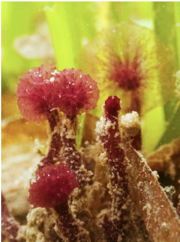
Fig. 2. In situ photograph of O. sagittaria sponge's spherical pink puffball (~1.5 cm across) and its short stalk (capitate osculum)

Few individuals were observed in the immediate area, and it was partly nestled between the shoots of seagrasses. The sponge did not form any large encrustations or mats; it maintained the characteristic small "puffball" form. Surrounding benthic fauna was sparse, with a few macroalgae and seagrass fronds; no other sponges of this or other species were noted nearby. Fig. 2, 3 and 4 provide a photographic view of the specimen in situ .