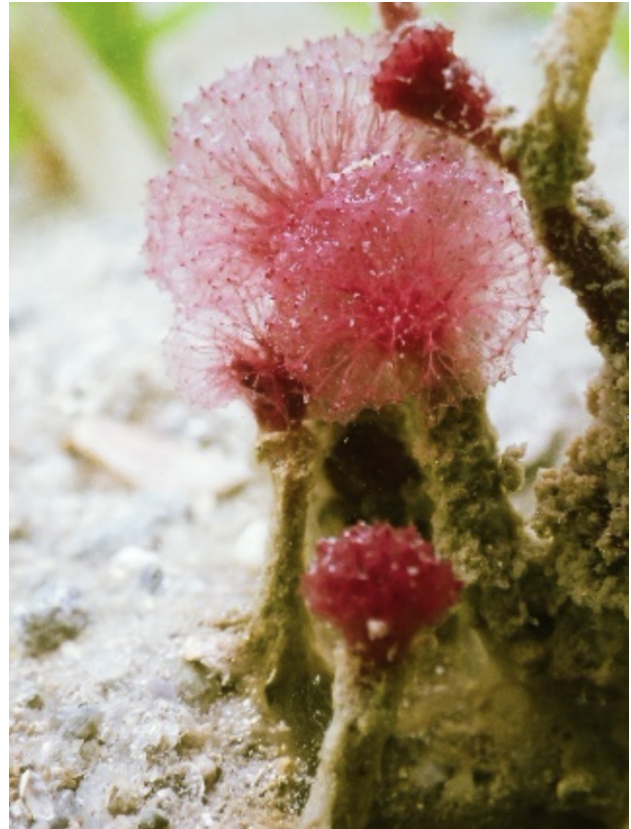
Fig. 3. Close-up view of O. sagittaria showing its surface texture and colouration

This study documented and tentatively identified O. sagittaria , in the dugong conservation reserve in northern Palk Bay with in situ photography. The first provisional photographic record of the species in the study site, not a confirmed taxonomic report. Previously, confirmed occurrences of this species were largely confined to Southeast Asia (Asa et al. , 1998; Xu et al. , 2022). Although prior records in India